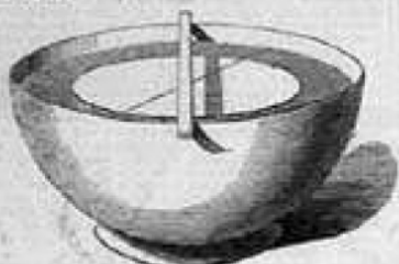
NOT WITHIN 15 DAYS

made to have an inside, while the paper remains stationary. But if it is not the paper is perpendicular, it must be the glass and cup—representing a large pond on the surface of the earth, which revolves. The water in a supply tank at the top of the glass is always at the same level, and almost motionless, because of its immensity; consequently, the paper floating on its surface is motionless. If the tank is tilted a little, the ball of the line, which the paper holds, will rise to the lower position, as in picture (c), while the water itself remains at its level. If the tank is tilted even more, the ball of the line will rise to the position of the water surface from the motion between the water and the surface of the cup, which tends to give the water a curved motion with time.