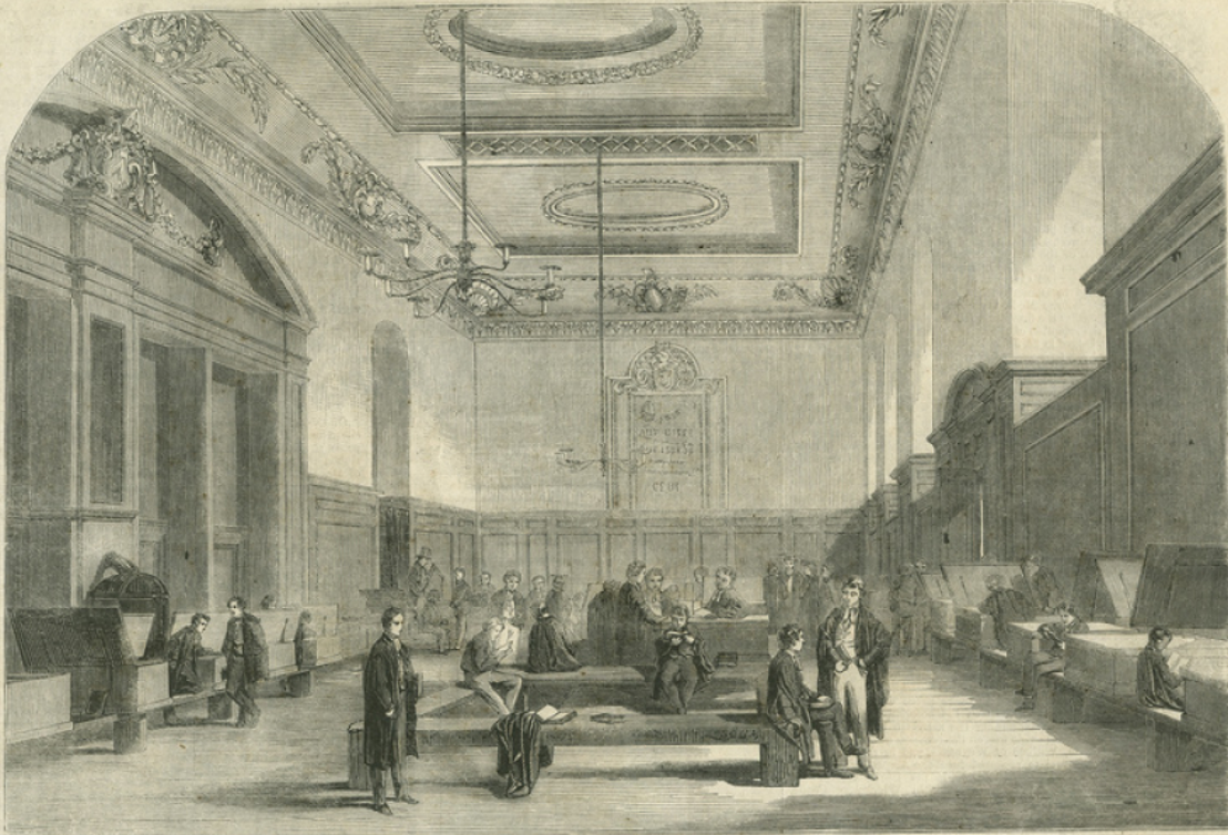
THE SCHOOLROOM OF WINCHESTER COLLEGE.

Wylliam Wykeham, who was to great with the King that all thing was done by him, and without him nothing done,"— Protestant , Lord Berners's trans. Chron. , cap. cxxiv, vol. I, p. 864. In the last year of Edward's reign Wykeham's good fortune experienced a check through the intrigues of a party headed by the Duke of Lancaster, upon whose accusation he was charged with misapplication of the public funds and other acts of improbity. Upon one charge only, and that of very trifling import, did the Court appointed to investigate the insinuations proceed to judgment. The other articles, having neither proof nor evidences to sustain them, were suffered