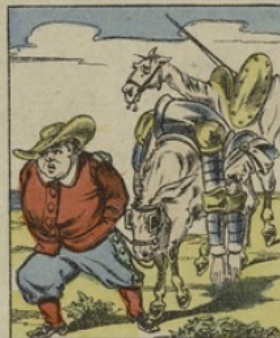
He is wounded during the fight and brought back by Sancho Panza.