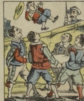
The faithful Sancho is tossed in a blanket.