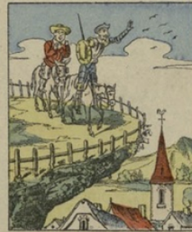
Don Quichotte relieved of his foolish ideas comes back to his native village.