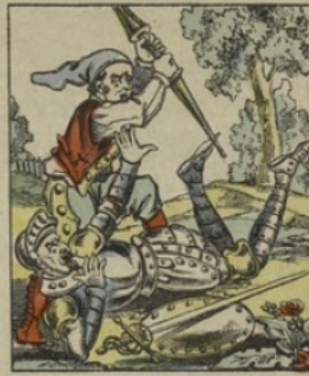
He is overcome by a muleteer whom he has attacked.