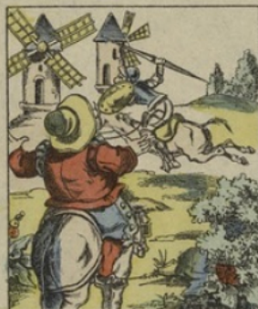
Don Quichotte makes an assault upon some windmills thinking that they were enchanted giants.