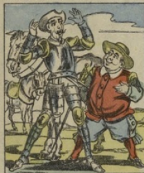
Don Quichotte to the great admiration of his equerry places on his head a barber's copper basin thinking that it is the golden helmet of Membrin.