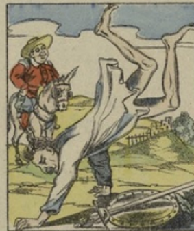
He performs cappers before Sancho and tells him to go and describe his sorrowful condition to Dulcinee.