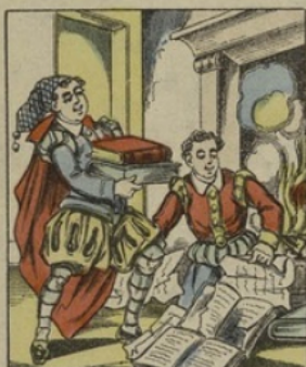
The physician having been sent for by the barber of the village burns all the books on chivalry, hoping thus to cure him of his madness.