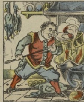
Happiness of Sancho at Gama-che's wedding.