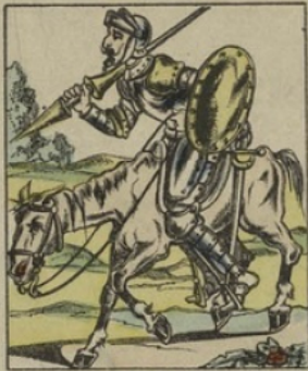
He sets out on the back of Rossinante and encased in a suit of armour in search of adventures.