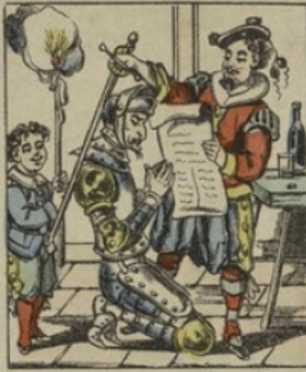
Don Quichotte asks an innkeeper to confer upon him the title of knighthood.