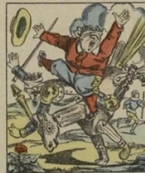
He returns from his trip through the air.