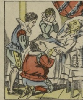
He dies in the midst of his family.