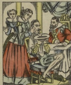
The waiting maids of the Duchess assist Don Quichotte in arranging his toilet.