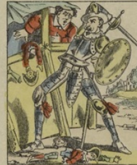
Don Quichotte makes an assault upon some puppets, thinking that they are soldiers.