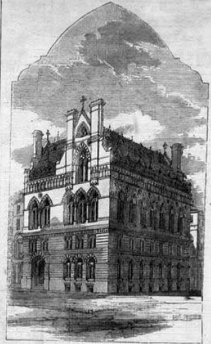
NEW NATIONAL SCHOOLS, ST. GILES'S-IN-THE-FIELDS.

in seconding the resolution, earnestly advocated clerical and lay co-operation in the great work of education. The resolution was unanimously adopted.