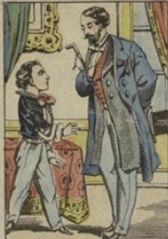
"I know one that still lives," replied a gentleman. "I will tell you what she has done for me."