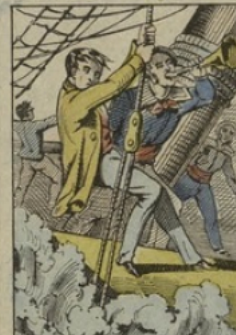
I went several voyages, experienced many storms: the Fairy told me to help the sailors manage the ship.