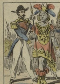
I conquered the rebels, and brought their chief to the Prince. Through the influence of the Fairy I married the daughter of a rich Nabob.