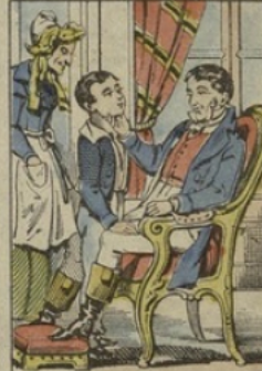
The banker took me into his house, and also my foster-mother, and he treated me as his own son. The Fairy told me to study.