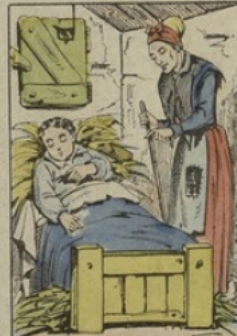
While I slept, the fairy said to me, "You must not take other people's goods, nor keep anything that does not justly belong to you."