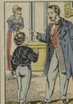
You wish to know the name of my Good Fairy, my young friends? She is called the Fairy "PERSEVERANCE."

"Printed expressly for the Humorous Publishing Co., Kansas City, Mo."