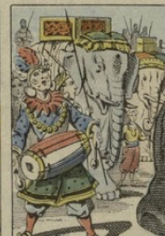
Twenty elephants, with gold harness, and driven by a hundred slaves, were laden with the marriage-dot, and the jewels and treasures, of my wife.