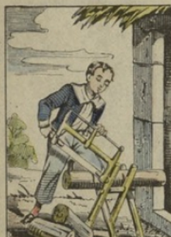
From that day, I earned my own living, and supported my foster-mother. I went errands, and chopped wood.