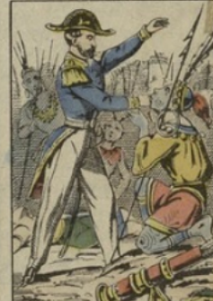
As I knew the Indian language, I was sent to subdue the rebellious tribes on the borders of the Gange.