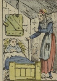
My benefactress had scarcely enough to keep herself. One night a Fairy came to me and said, "Go to the market to-morrow."