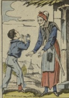
When I was your age, I was an orphan, without home, and without food. A very poor woman gave me shelter, out of charity.