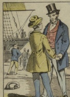
When I was sixteen, my patron, sent me to the Indies to establish a counting-house amongst the savages.