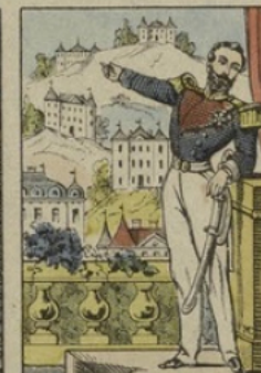
To day I have more castles, than the Marquis of Carabas. I have come to take this news, to my foster-mother.