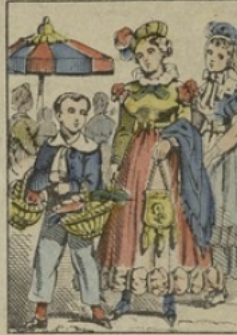
The next day I went to the market, several ladies gave me their baskets to carry, for which they rewarded me with half pence.