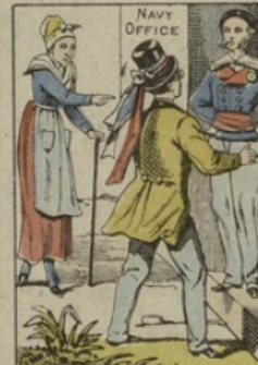
When I was twenty years of age, my patron died, and fortune no longer smiled upon me. The Fairy told me to enter the Navy.