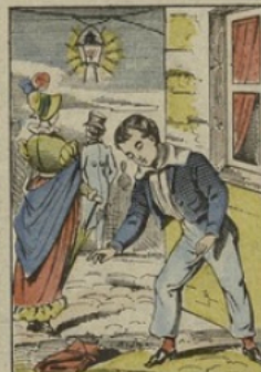
One evening I found a pocket book filled with letters and bank-notes. I put this treasure under my pillow.