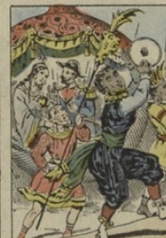
Our nuptials were performed according to the custom of the country. My future bride and I were driven to the temple, in magnificent palanquins.