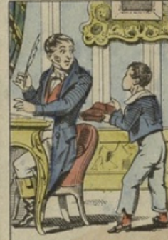
The next day, I went to return the pocket book to a banker, who had advertised his loss.