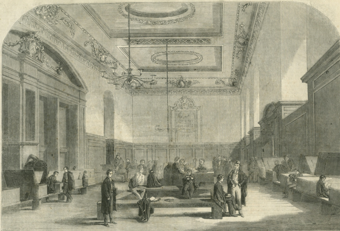
THE SCHOOLROOM OF WINCHESTER COLLEGE.

Wylliam Wykeham, who was to great with the King that all thing was done by him, and without him nothing done,"— Proseurs , Lord Berners's trans. Chron. , cap. cxxiv, vol. I, p. 864. In the last year of Edward's reign Wykeham's good fortune experienced a check through the intrigues of a party headed by the Duke of Lancaster, upon whose accusation he was charged with misapplication of the public funds and other acts of improbity. Upon one charge only, and that of very trifling import, did the Court appointed to investigate the insinuations proceed to judgment. The other articles, having neither proof nor evidences to sustain them, were suffered